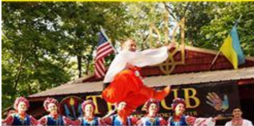
Ukrainian American Sport Center, Horsham, PA