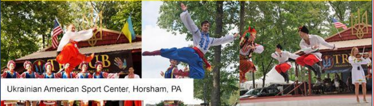
Ukrainian American Sport Center, Horsham, PA

Sunday, August 24, 2025 (12:00 - 8:00pm)