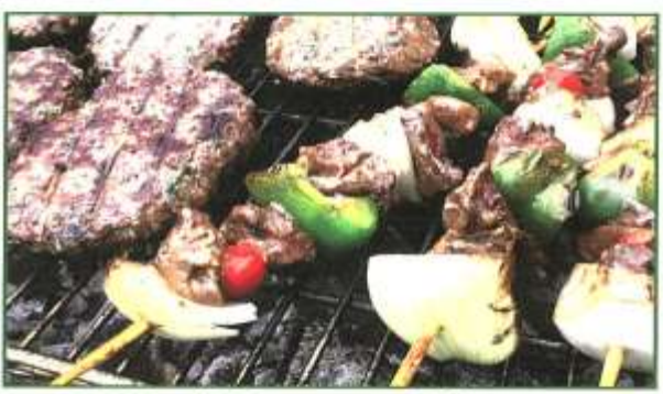
Grilled Meats and More ...